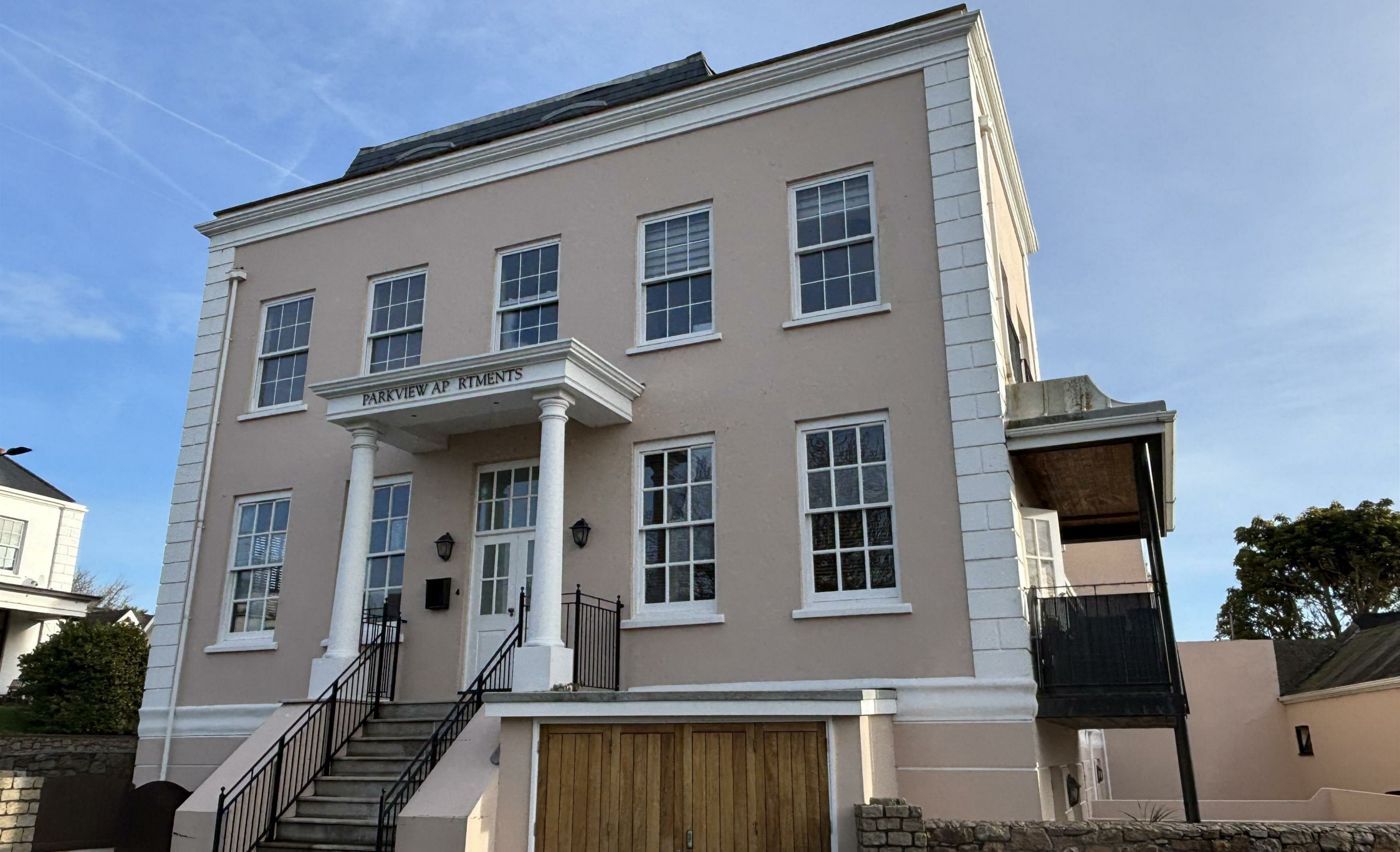
Apt 8 Park View La Route Du Fort, St Saviour, Jersey, JE2 7PA £550,000